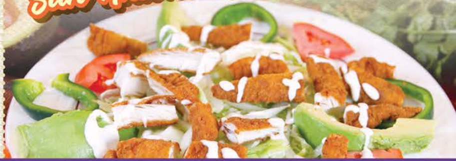
San Antonio Salad