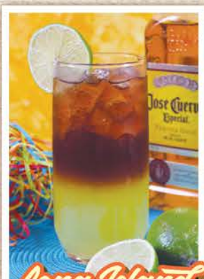
Long Island Iced Tea