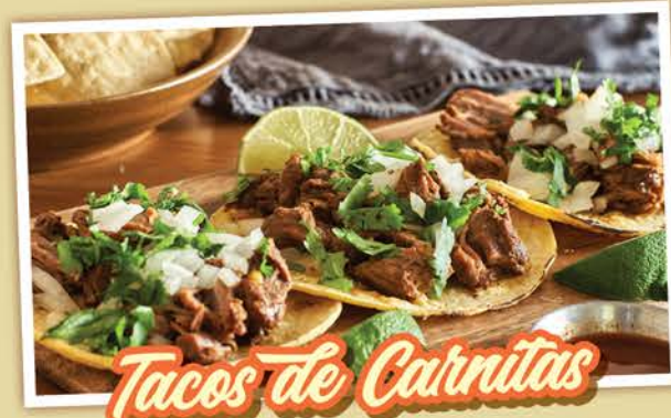
Tacos de Carnitas

ALL TACOS SERVED WITH CORN TORTILLAS EXCEPT FISH AND BUFFALO SHRIMP TACOS.